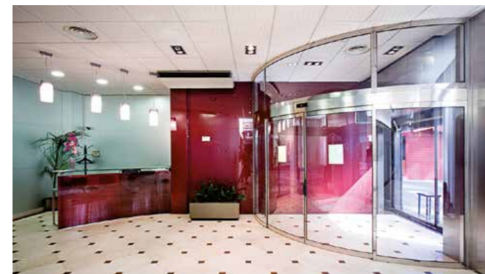
Circular automatic door. Library.