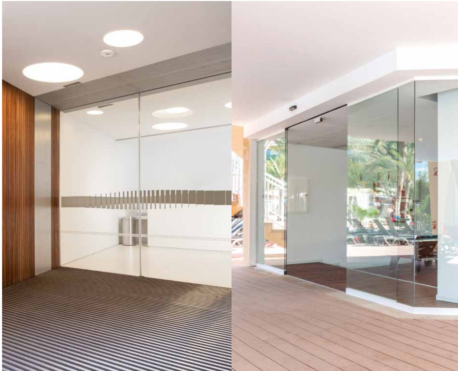
Single sliding door with total transparent leaves, option of hidden rail. Museum sector.