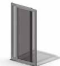
45 mm frame

Applicable to bi-parting and single automatic sliding doors.