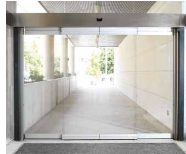
Panic break-out door without vertical stiles. Shopping centre.

The door functions in normal mode (sliding and automatic). In an emergency, the leaves can be pushed outwards by hand, and automatically retract to the sides to create a large opening for evacuation.