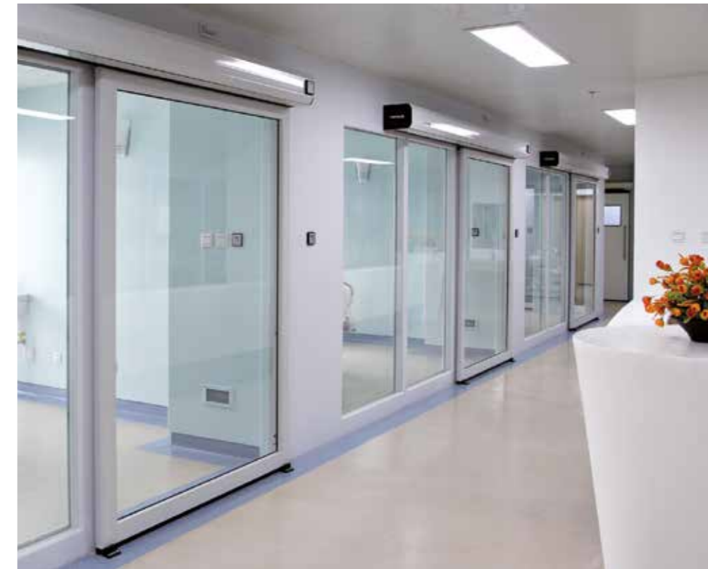
Clear View glass hermetic doors. Hospital ICU room.