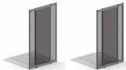
20 mm frame

Applicable to bi-parting, single sliding, telescopic, curved and semicircular automatic sliding doors.