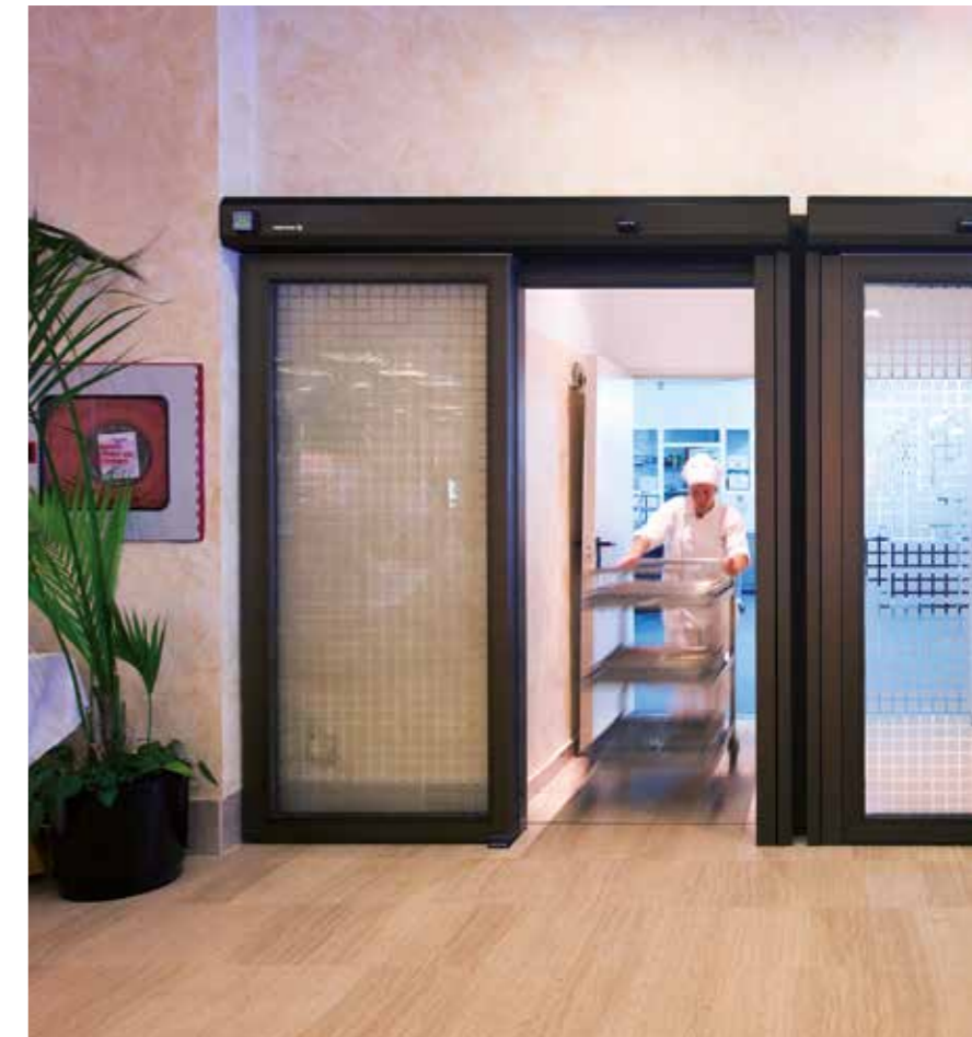
Fire-resistant door separating kitchen and restaurant. Hotel sector.

Manusa's fire-resistant door consists of a bi-parting or single sliding automatic door with fire-resistant properties.