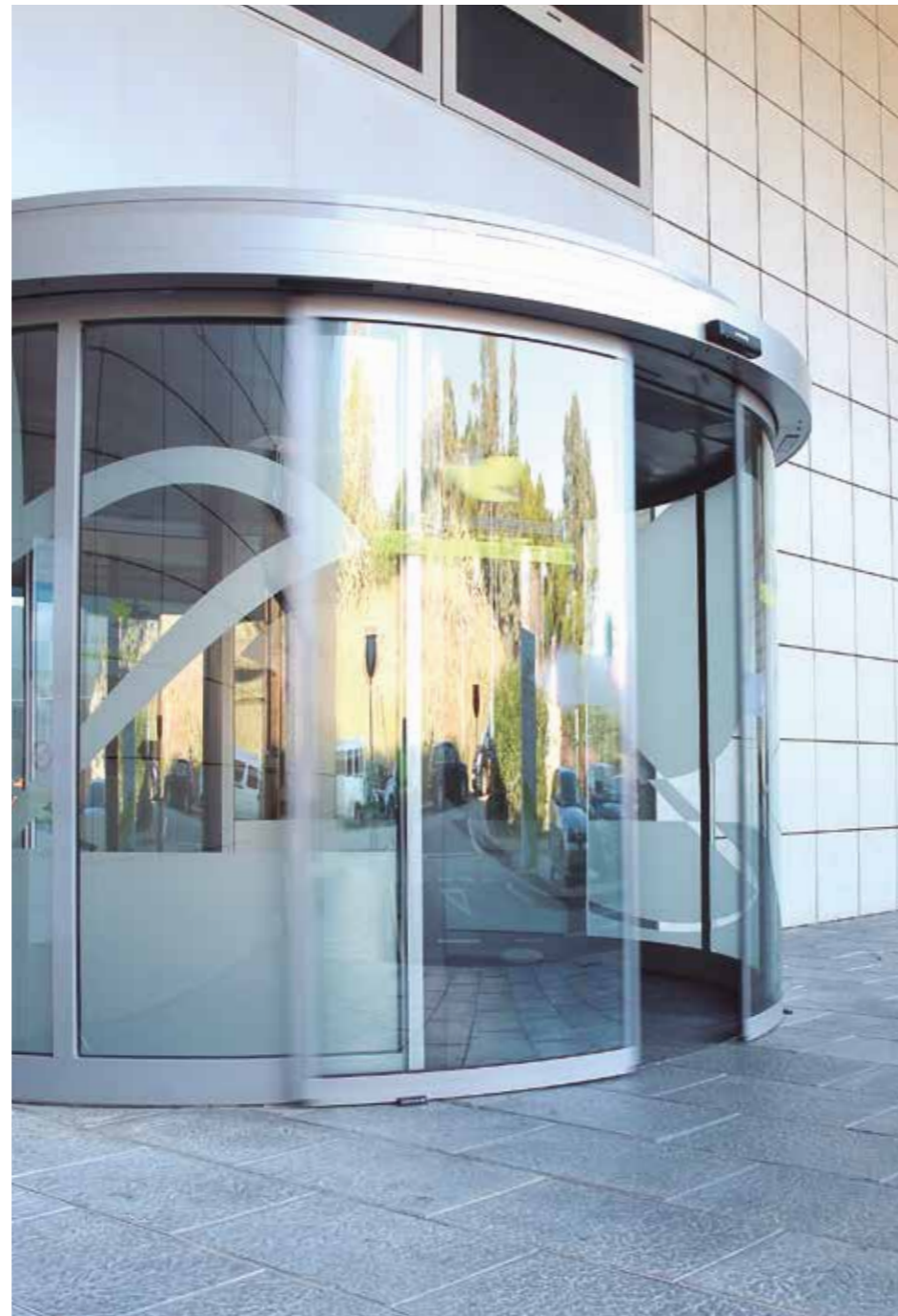
Circular automatic door. Hospital.

The door may be concave or convex and with different radius and degrees of curvature. The combination of two curved doors creates circular doors, ideal for entrances that are both exceptional and functional at the same time.