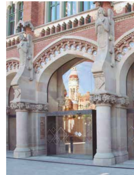
Single sliding door. Museum sector.