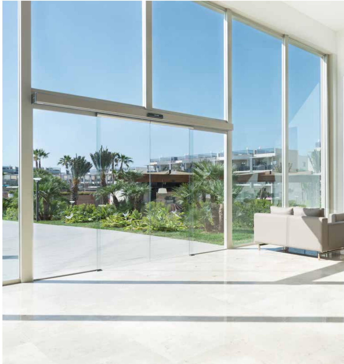
Bi-parting sliding door. Hotel sector.

Manusa bi-parting and single sliding doors offer the highest opening speed on the market, together with maximum safety. They are recommended for high traffic public entrances and exits or where user safety is linked to the fluidity of the traffic.