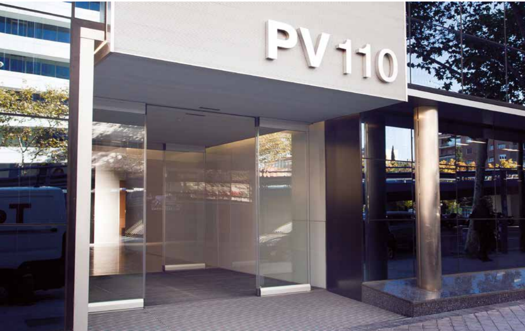
Panic break-out door without vertical stiles. Office building.

The automatic doors with Manusa's panic break-out mechanism combine the features of a sliding door with the safety of break-out leaves, thus maximising the opening.