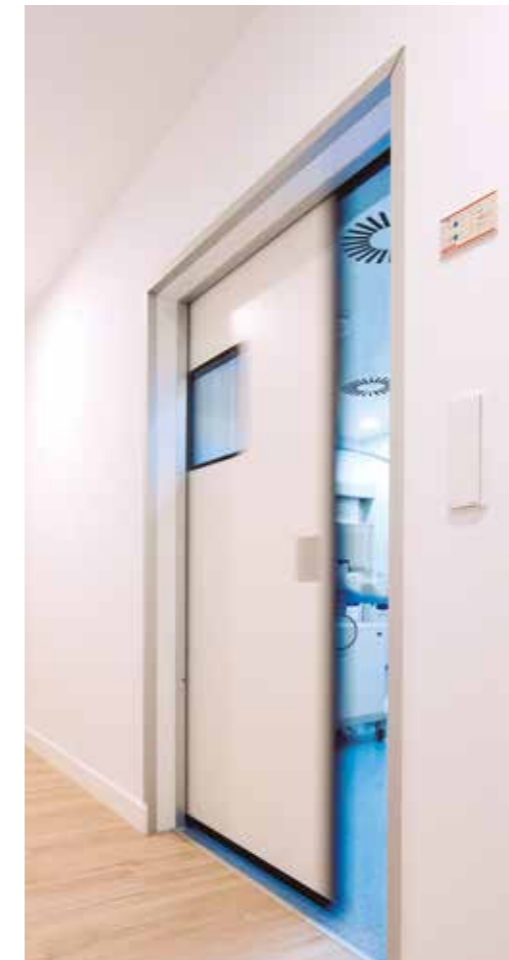
Hermetic sliding doors. Hospital operating theatres.

The whole door assembly is designed to guarantee hygiene: recessed vision panel, door handle, easy cleaning materials.