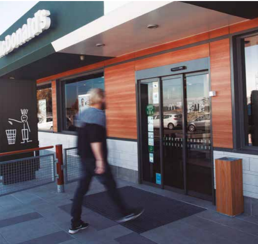
Telescopic sliding door. Restaurant sector.

They are ideal for entrances with space limitations, for corridor separations, or where the opening needs to be wider than usual, for example at car showrooms.