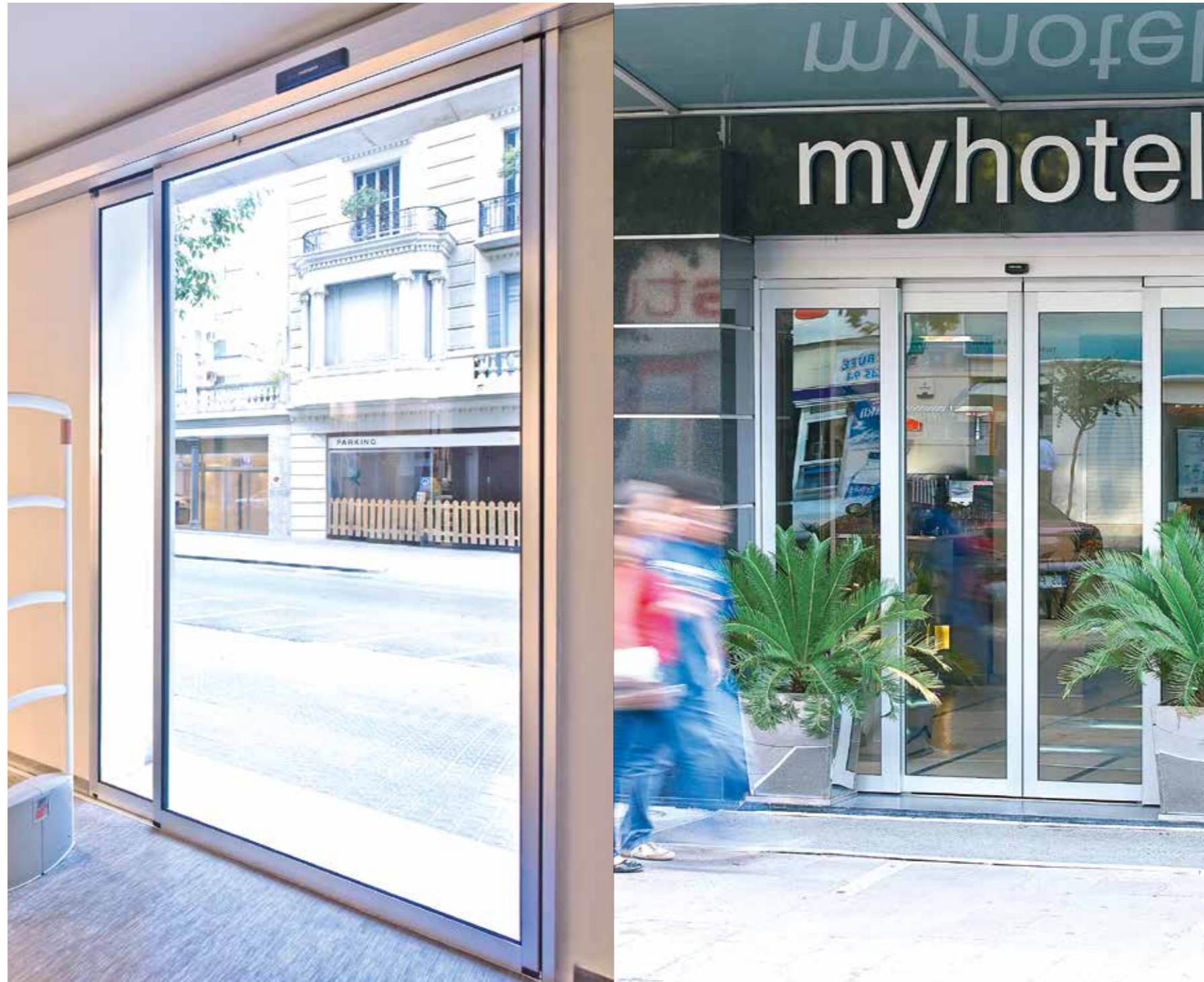
Single sliding door with framed leaf. Retail sector.