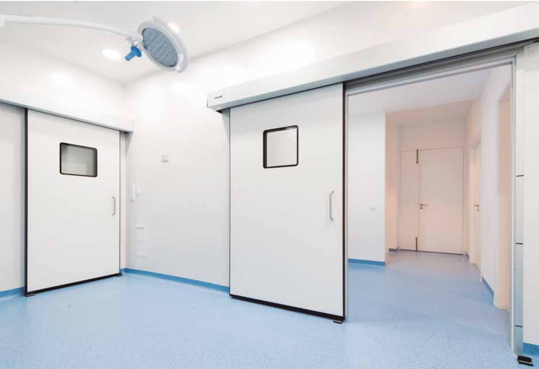
Hermetic sliding doors. Hospital operating theatres.

Manusa's hermetic doors unite the advantages of an automatic door with the seal and hygiene required in clean room environments.