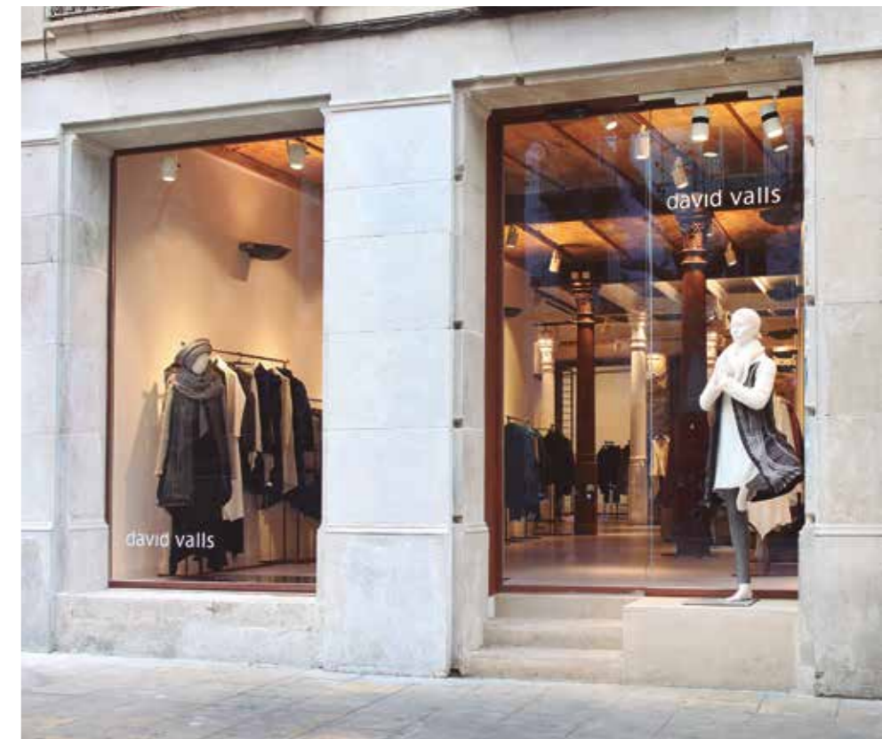
Single sliding door. Retail sector.