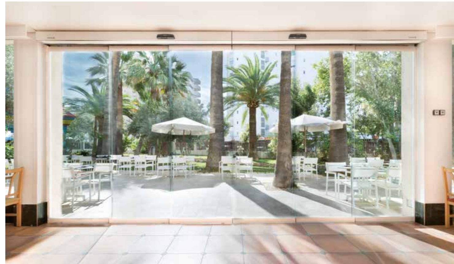
Telescopic sliding door. Hotel sector.

Sliding door with 2 sliding leaves that move to one side. The sliding leaves retract one behind the other to leave the maximum possible opening at one side of the door.